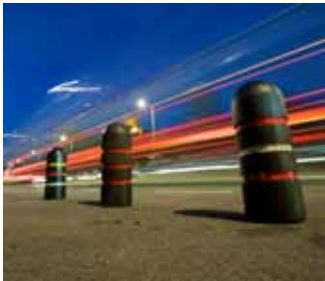
Recycled plastic street bollards by JFC