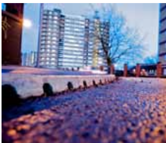
Recycled plastic Envirokerb by Pipeline and Drainage Systems plc